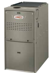
Lennox Merit Series™ Internal Model